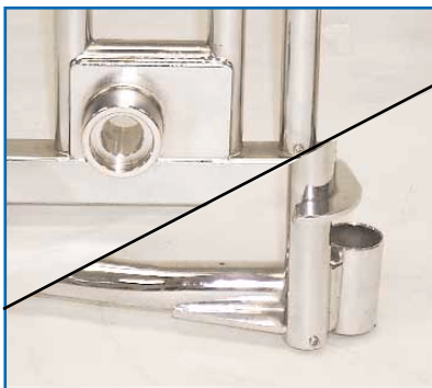
Reinforcement weld on all key locations.