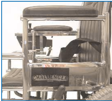
Standard adjustable height arms let patient choose most suitable arm height for all day comfort.