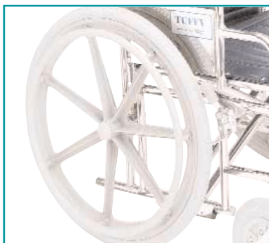
Composite handrims eliminates uncomfortable feel in winter time