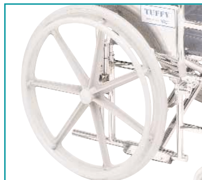
Composite handrims eliminates uncomfortable feel in winter time