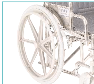
Composite handrims eliminates uncomfortable feel in winter time