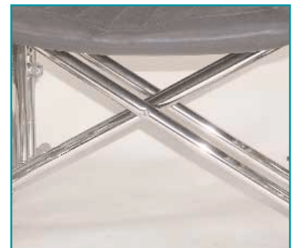
Double cross bar construction on all 356 models to withstand the extra weight.