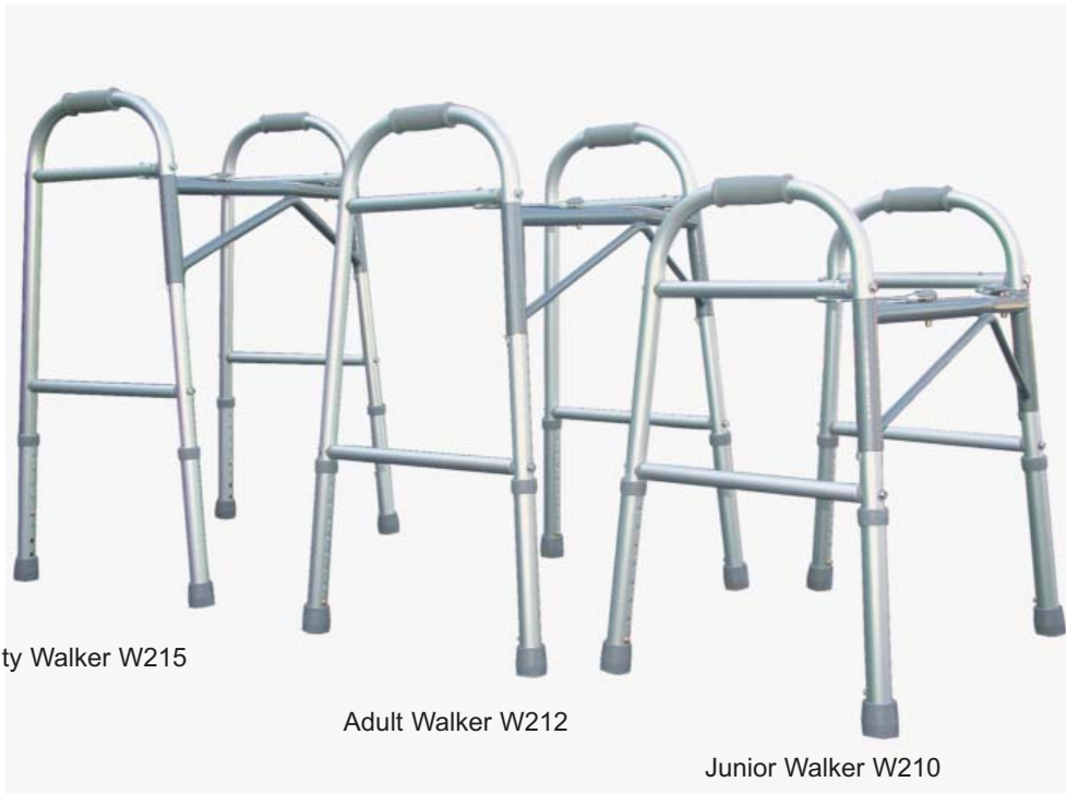
Heavy Duty Walker W215