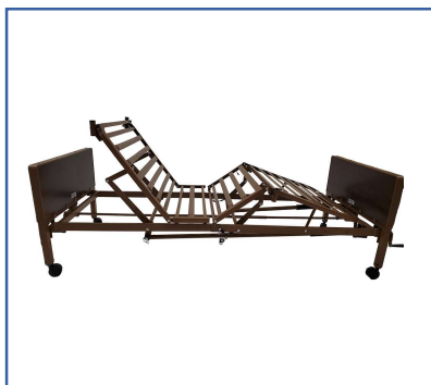
Motor controlled bed adjustments for upper body & knee positioning for maximum user comfort.