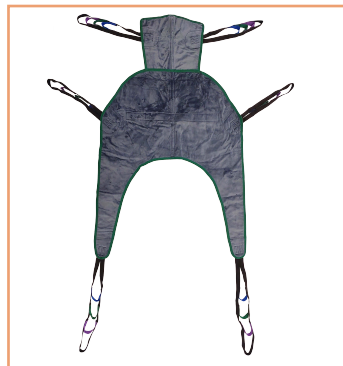
P135 - P138 Universal Sling with Headrest

Solid Fabric, Canvas holds up to 600 lbs. Adjusts in 3 sizes to fit most patients.