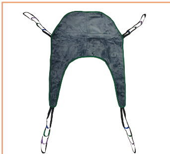
P130 - P133 Universal Slings

Solid Fabric, Canvas holds up to 600 lbs. Adjusts in 3 sizes to fit most patients.