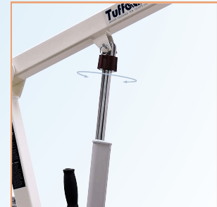
Emergency Lowering Knob

RHINO™ patient Lifter is designed to help reduce the possibility of a caregiver injury and to ensure dignity in resident handling. Heavy gauge carbon steel construction with powder coated frame. State of the art electronic system, includes emergency lowering knob. Accommodates all types of slings.