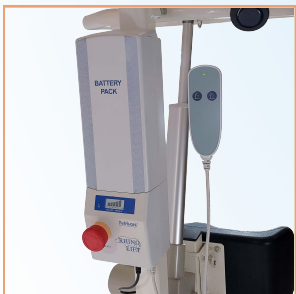
Emergency Operation Dial