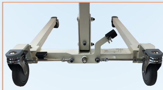
Foot Pedal Design