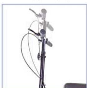
Adjustable Handlebar Height