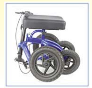
2 Quick Folding Latches