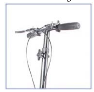
Dual Handle-Mounted Lockable Brakes