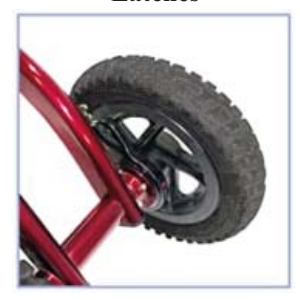
Rear Drum Brake