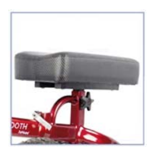
Padded Knee Platform