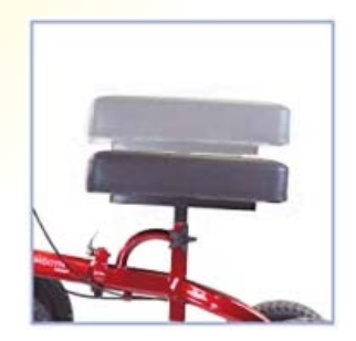
Adjustable Knee Platform Height