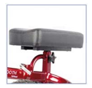
Padded Knee Platform