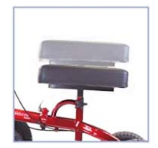
Adjustable Knee Platform Height