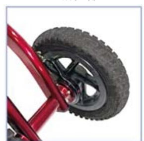
Rear Drum Brake