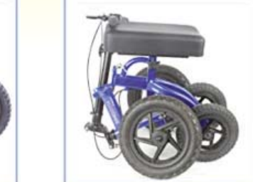
2 Quick Folding Latches