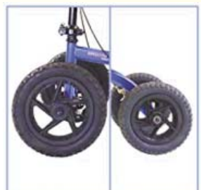
Pneumatic Tires with Airless Inserts