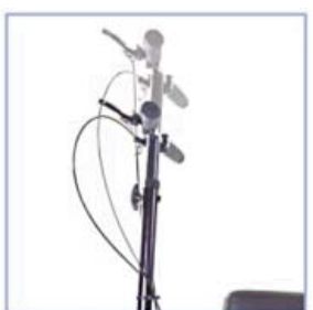
Adjustable Handlebar Height