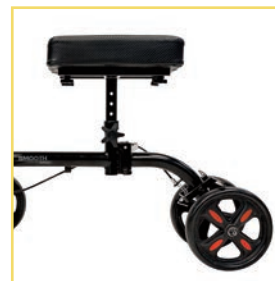
Tucked-in Rear Wheels