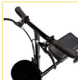
Dual Handle Mounted Lockable Brakes