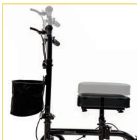
Adjustable Handlebar and Platform Height