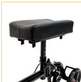
Contoured Knee Platform